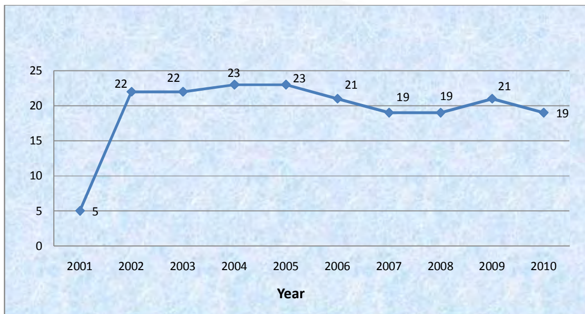
Share of foreign trade in GDP-percent